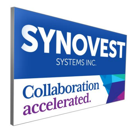
Wall Mounted Backlit Lightbox Multi Sizes Available

Attract attention and direct traffic. Custom signage gives planners and exhibitors much-needed flexibility and can be used throughout the hotel.