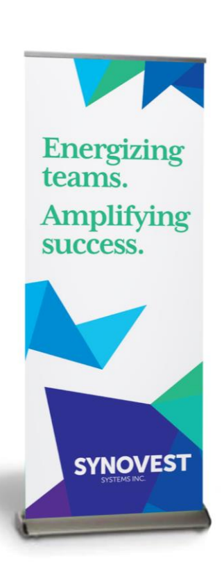
Deluxe Adjustable Retractor Display

Attract attention and direct traffic. Lightweight and easily moved, standing signage gives planners and exhibitors much-needed flexibility and can be used throughout the hotel.