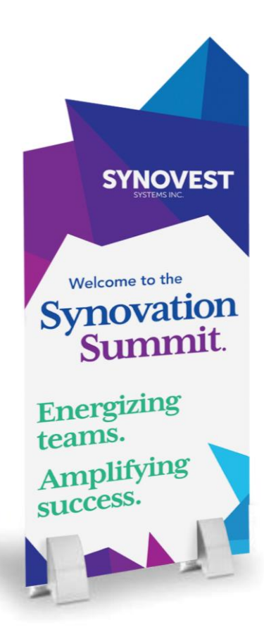
Meter Board with Display