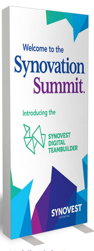
Mobile Light Boxes