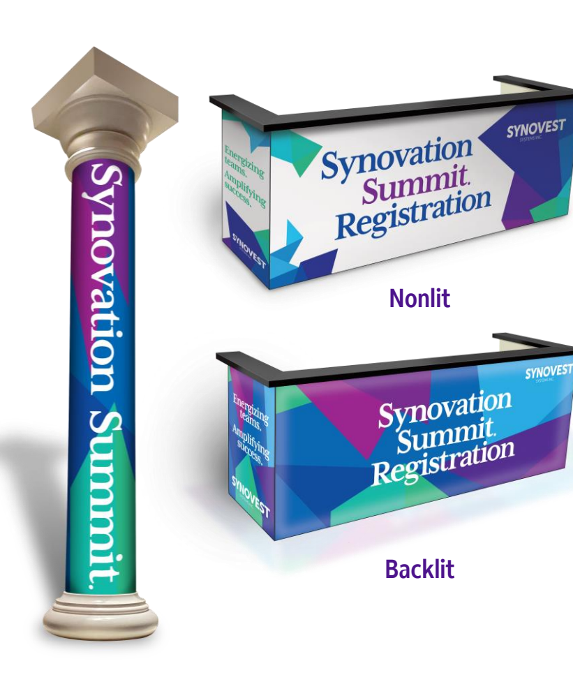
Fabric Column Wraps