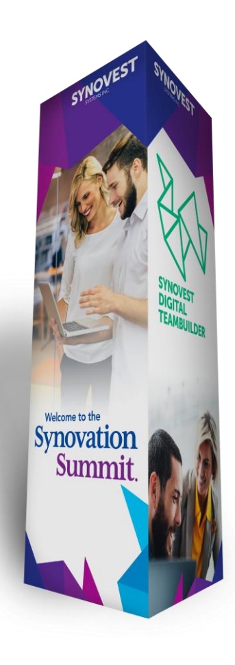
Four Sided Column Wraps